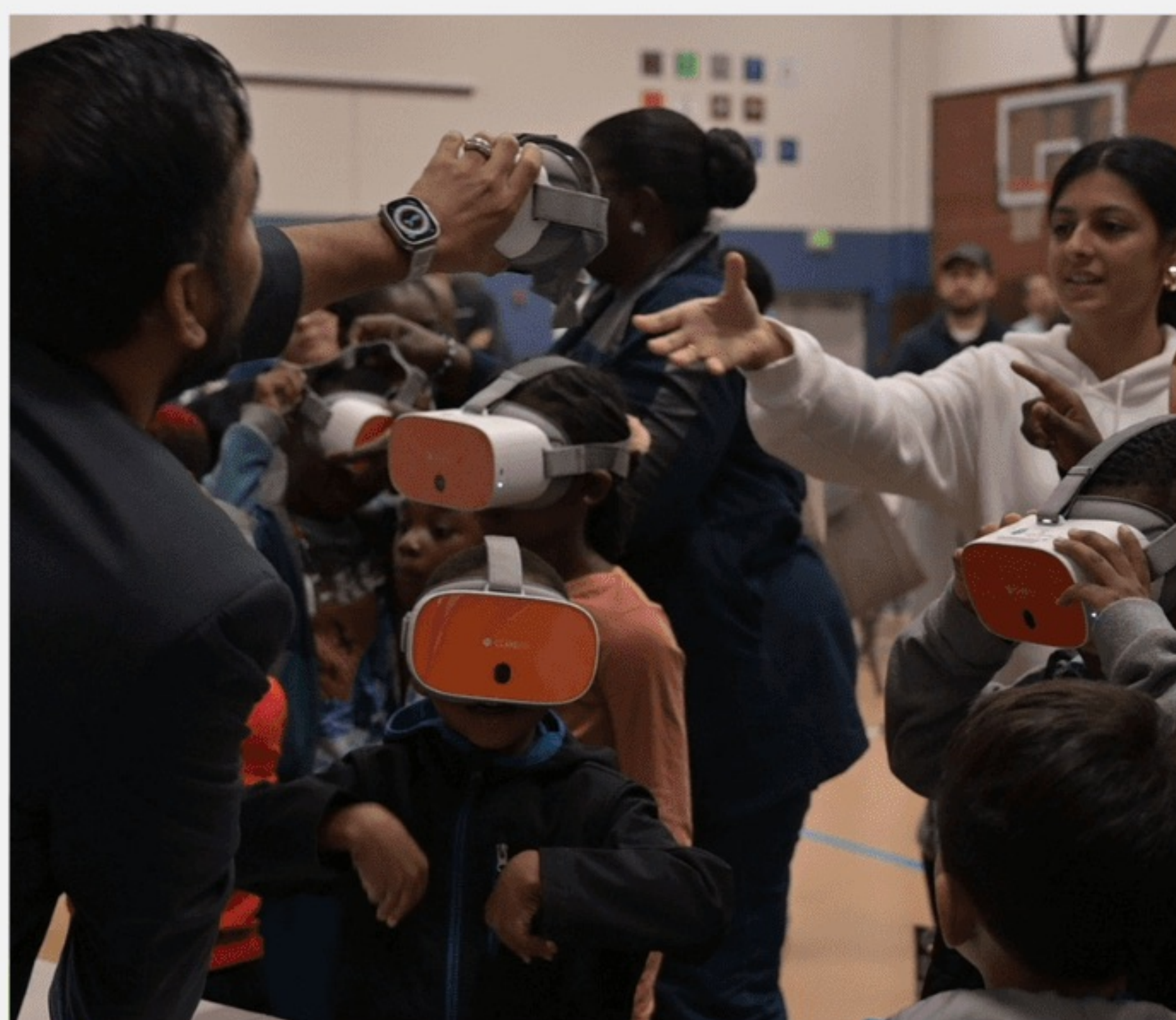
CLF's newest school, Chesapeake Science Point Elementary Public Charter School, holds an open house for many of its prospective families. After the presentation and Q&A, families experienced VR as it might be used in the classroom.