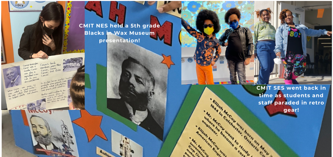
CMIT NES held a 5th grade Blacks in Wax Museum presentation!